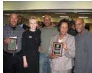
Princeton Street Block Club