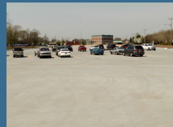
Beneath this parking lot is the Chapaton RTB's 28-million-gallon storage compartment that prevents untreated combined sewage from overflowing into Lake St. Clair. The red brick pump station in the background is capable of pumping up to 700 gallons of combined sewage per minute into the facility. Typically, the average E. coli count per 100 milliliters is in the single digits for the discharge from this facility.