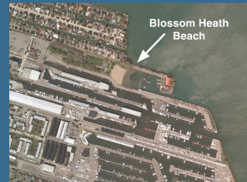
Blossom Heath Beach's physical location and lack of water circulation create water quality challenges.