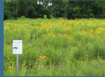
Green infrastructure like Wayne County's grow zones in the Rouge River Watershed can increase the volume of storm water that infiltrates the land reducing the amount of polluted runoff reaching our waterways.

In a study McLellan conducted for the Milwaukee Metropolitan Sewerage District that monitored 62 municipal storm water outfalls over three years, she found that bacteroides and E. coli don't always travel together in the same proportions. The concentrations of E. coli did not correlate to the presence of bacteroides confirming that humans are just one of many sources that contribute E. coli to storm water.